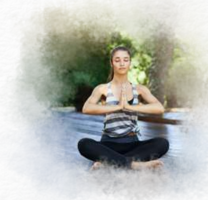
YOGA & MEDITATION PARK