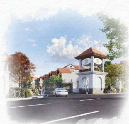
ON 60 METER WIDE ROAD